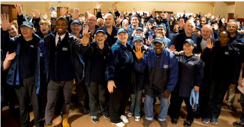
Street Pastors about to go on patrol in Manchester on the Friday of the practitioner conference

What was also of great interest was to learn how SPs are being invited to partner with other organisations. Many will have heard of School Pastors, but other ministries include gun & knife collections points, caring inside