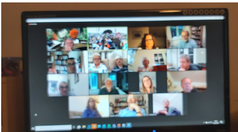
The 2020 AGM by Zoom