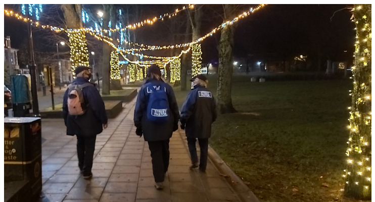
Street Pastors on patrol. The pink bag contains extra PPE.