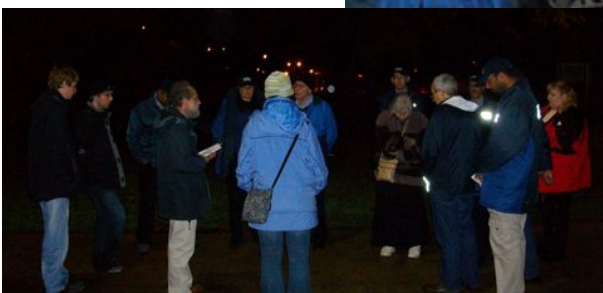
Prayer walkers set off from Wells Place. Praying at Grantham Green (inset)