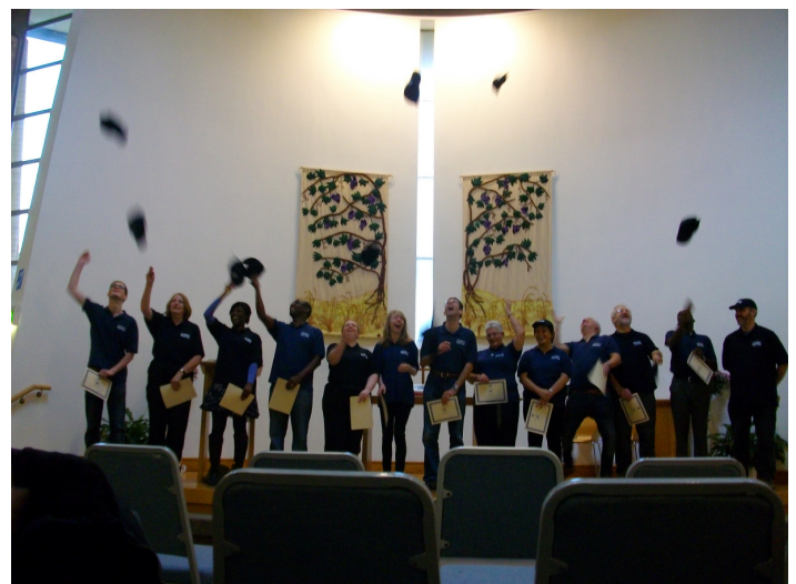
Street Pastors celebrating their graduation at St Luke's Hedge End on 7th December 2014