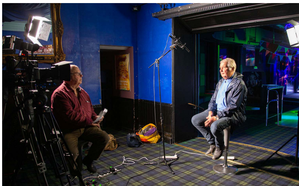
Shooting an interview for our recruitment video at Marilyn's night club