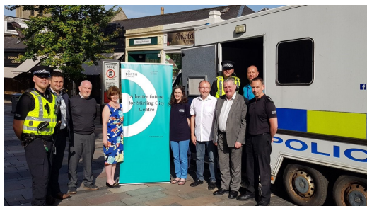
Operation Steadfast launch, summer 2019