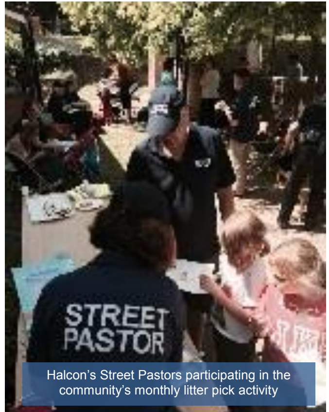
Halcon's Street Pastors participating in the community's monthly litter pick activity