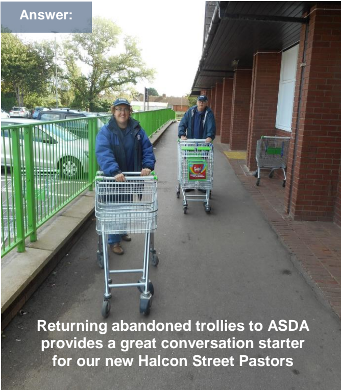
Returning abandoned trolleys to ASDA provides a great conversation starter for our new Halcon Street Pastors