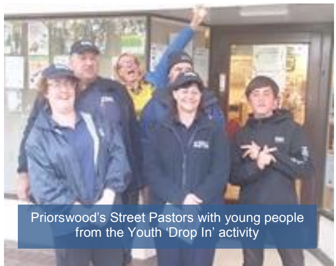
Priorswood's Street Pastors with young people from the Youth 'Drop In' activity

'My granddaughter would like to say a big "Thank you" ... as she received much help (and flip flops) on numerous occasions in the early hours in Taunton' – a local Parish Councillor